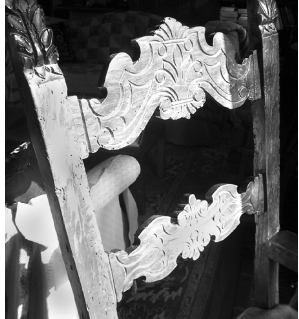
One of many great items saved from the wrecking ball!

We would like to give a very special thank you to the members of the Ebell Club for hosting the event and Catholic Worker (who provided the catering) for their hard work in preparing and serving dinner for the evening, helping to make the evening special for all.