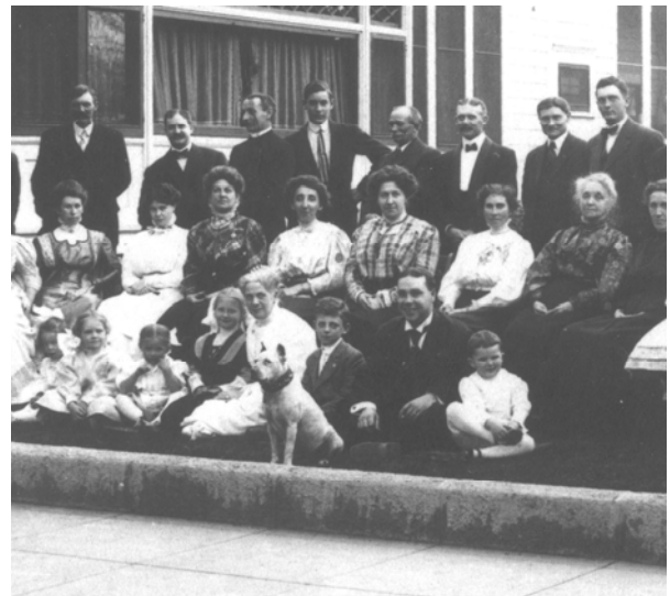
Christmas 1907 at the Howe-Waffle House